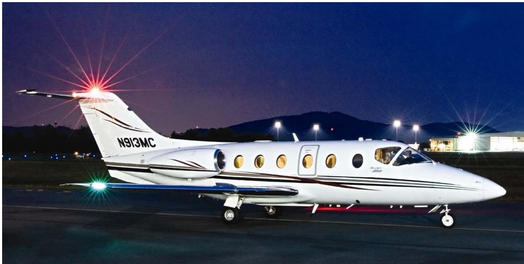
Beechjet 400 - N913MC