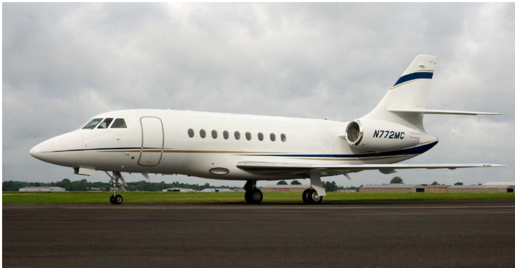
Falcon 2000EX - N772MC