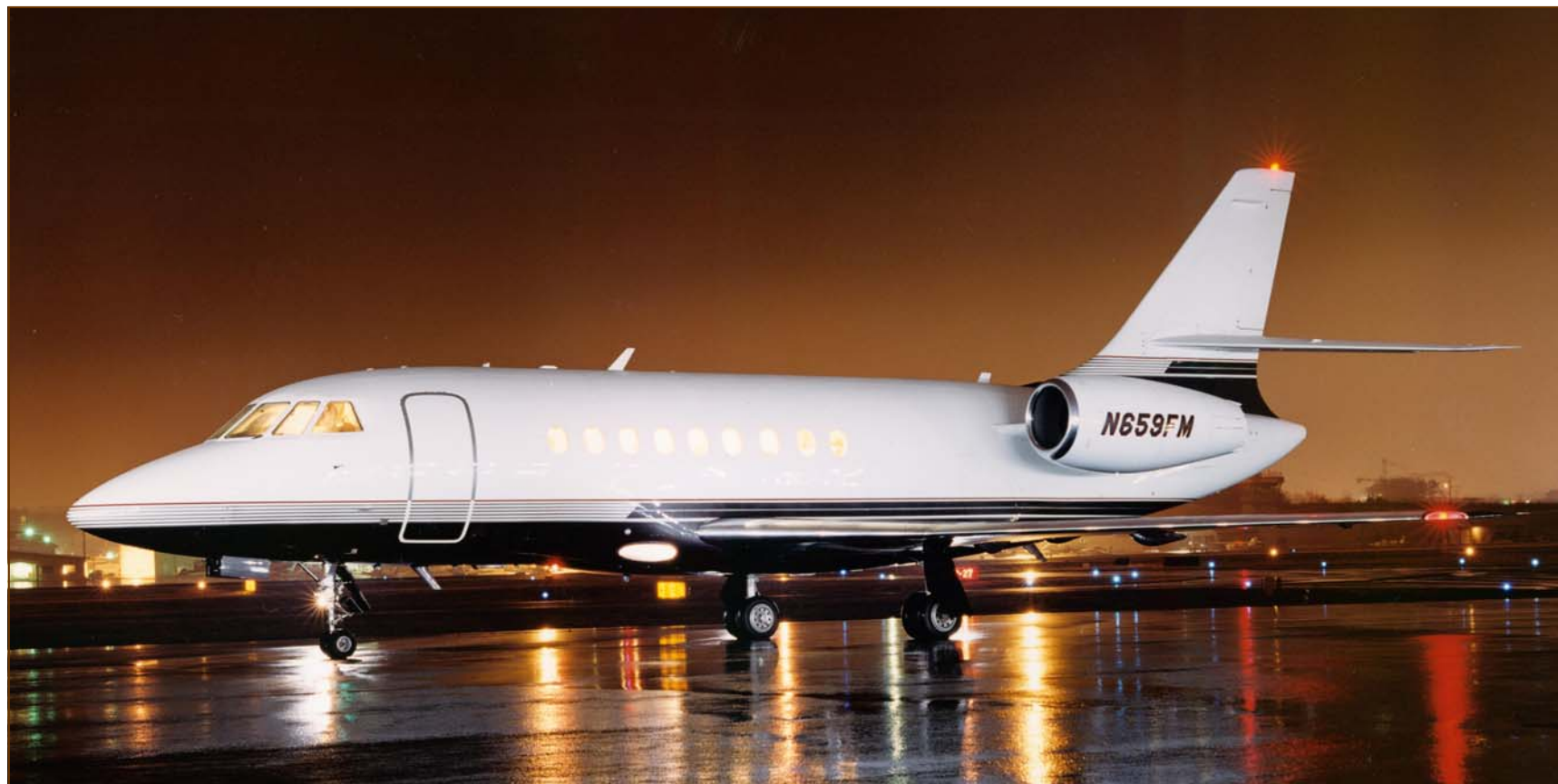
Falcon 2000 - N659FM