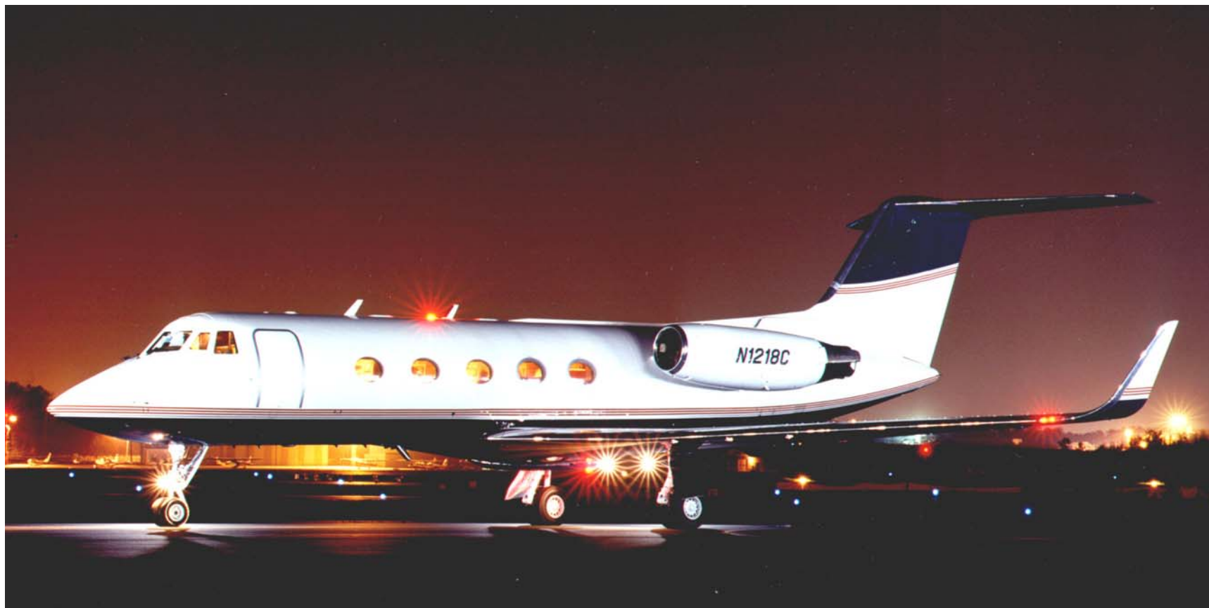
Gulfstream II SP - N1218C